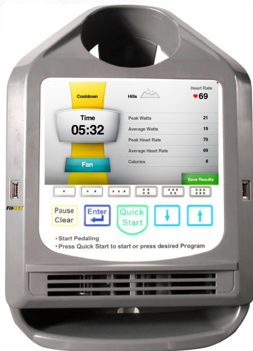
Cool Down Screen