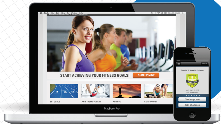
WEB & MOBILE