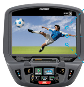
2 E3 View Optional Display