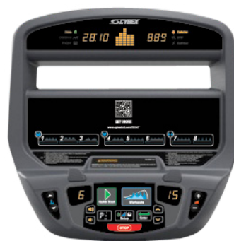
1 Standard Display

The 525 Series standard console features a unique QR code that provides users with access to a mobile device optimized web-app to get the most out of their 525 workout. With features such as how-to-use videos, step-by-step instructions and training tools, exercisers can create and follow their own fitness programs. The optional high definition E3 View embedded wide screen monitor provides three distinct viewing modes that deliver the precise content you want on a 15.6" screen.